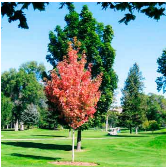
Ray & Hannah Fox Memorial Tree #10 Green

For those reasons, Club members may not date or pursue romantic and/or sexual relationships with Club employees. Club members who violate this policy will be subject to discipline, up to and including suspension or expulsion in accordance with MCC Bylaw Article VI. [09/2008] [Rev. 09/2009]