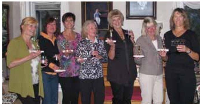
The Winners—MCC WGA 2011 Top Team

Speaking of fall golf, we will once again be installing three cups in each green this year. We should have this accomplished sometime around November 8. Please rotate the flag to a different cup upon finishing the hole. We will also have the greens sanded by then and plan to leave the greens open for play this winter when conditions allow. Our staff would like to thank the membership for a great golf season.