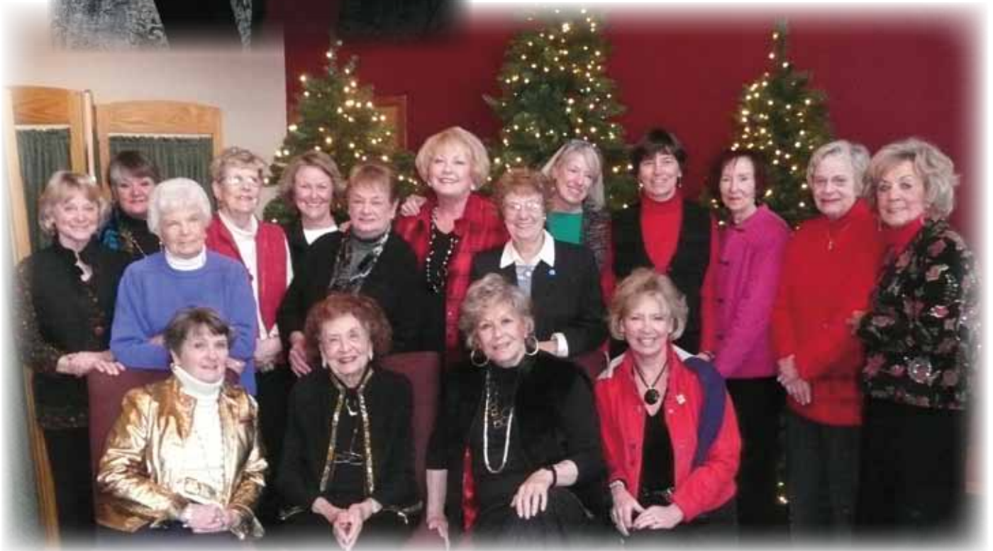
Members of the Bridge Group celebrating Christmas