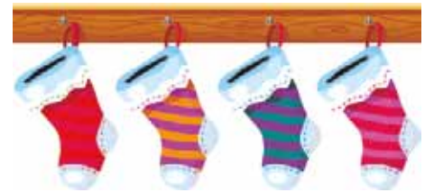
Fall Luncheon "High Tea"