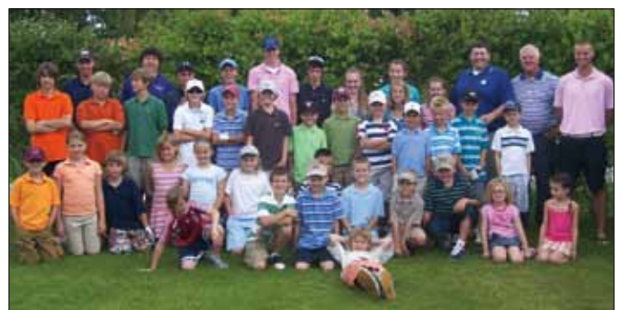
MCC Junior Golf Champions July 23, 2010